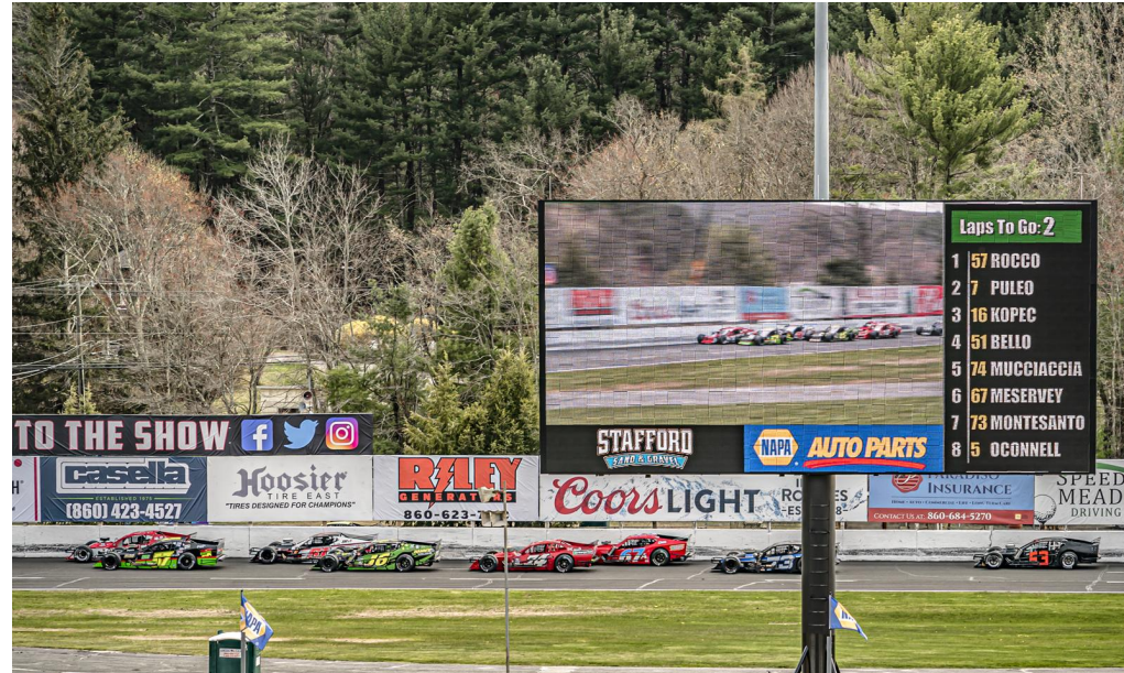
Stafford's 20' x 40' Video Scoreboard Features Driver Content at Each Event