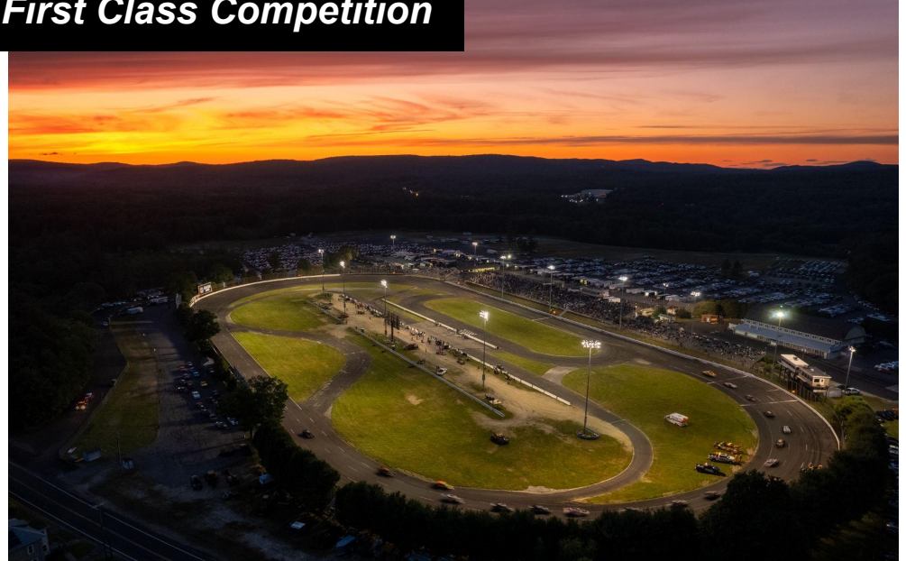
Friday Night Lights at Stafford Speedway